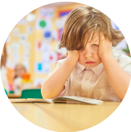
Attention & Academic Challenges