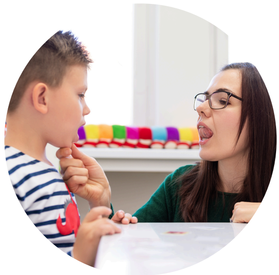
Speech & Language Challenges